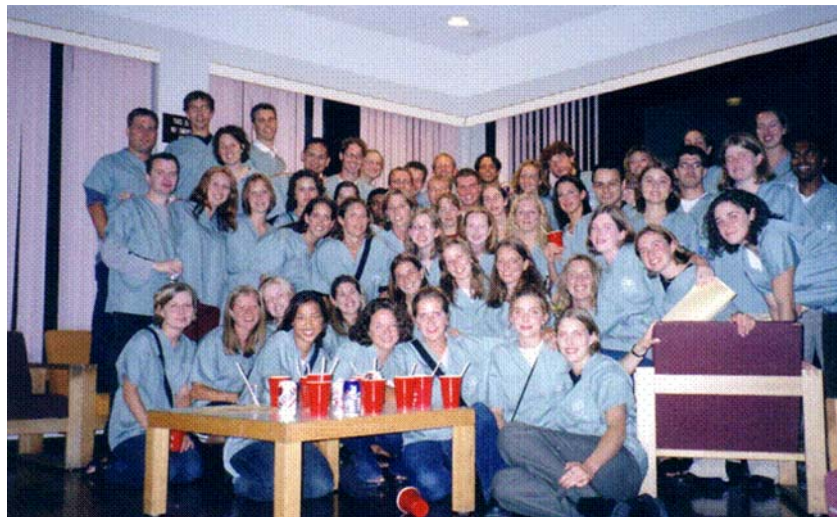
Class of 2006 Green Shirt Ceremony (Orientation week 2002)