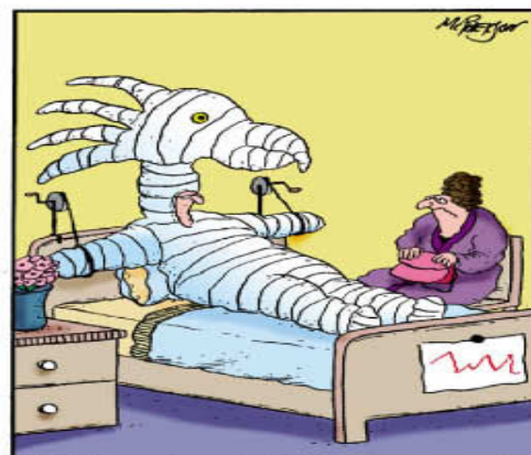
"The intern who worked on me was an art major before going to med school." www.4to40.com/images/jokes/art_medical_school.jpg