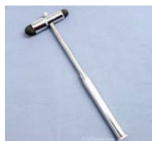
Troemner design