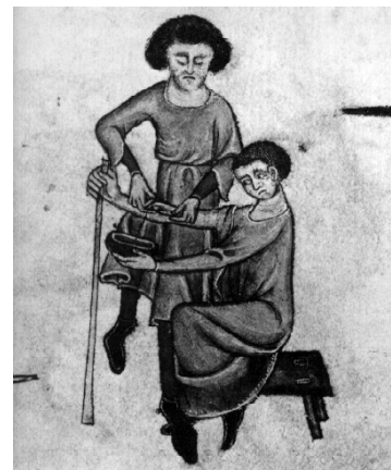
The barber's pole in action

The barber's pole was a tool for bloodletting. He would have the patient (customer?) grasp the pole to expose the veins in the forearm, and the brass bowl on top was used to collect the blood and, in more recent history, to contain the leeches. When the barber's work was finished, he would collect the blood-soaked bandages and dry them on his pole outside the shop. The wind would often wind the bloody rags around the pole resulting in the highly recognized symbol outside many barbershops today.