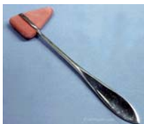
Taylor design

Of course, the most important thing is that regardless of the hammer's design, only practice will allow confidence and accuracy in reflex testing.