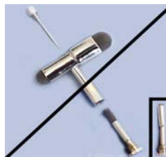
Buck design