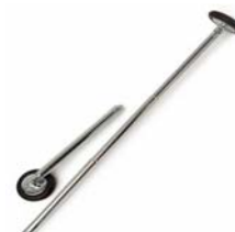
Queens Square design